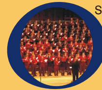
St. Michael's Choir School